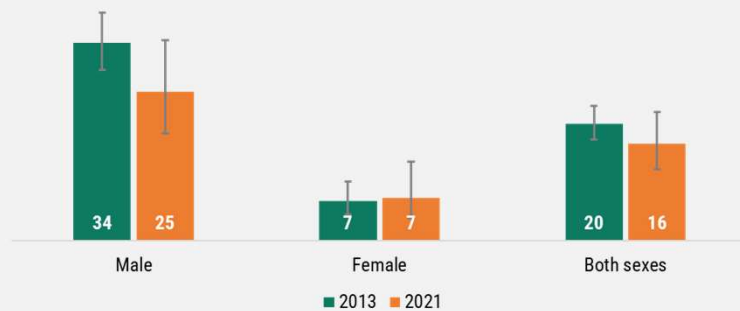
Figure 2. Percentage of youth in SOCCSKSARGEN who have had sex before age 18