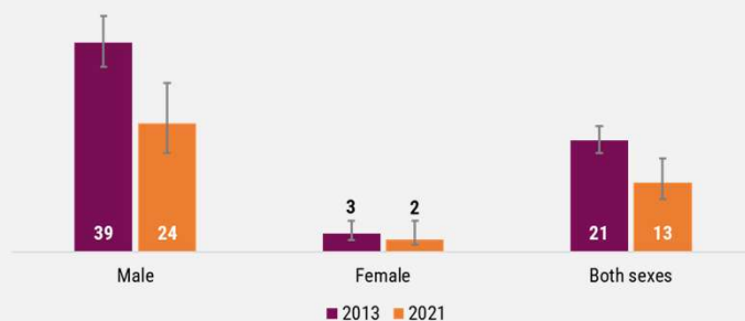
Figure 2. Percentage of youth in MIMAROPA who have had sex before age 18