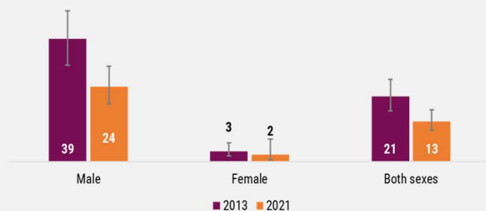
Figure 2. Percentage of youth in CALABARZON who have had sex before age 18